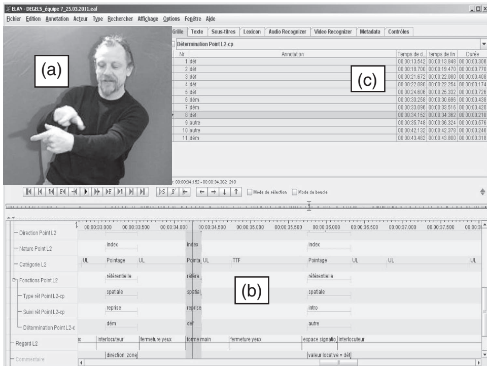
Fig. 72.4: Screen capture of annotation with ELAN (Garcia et al. 2011)

ELAN is programmed in Java under xml and is compatible with Mac OS as well as with Windows and Linux. It is part of a set of freeware tools available on the Max Planck Institute platform (Language Archiving Technology), where it is connected, in particular, to the ARBIL tool for the precise (and almost exhaustive) administration of metadata (IMDI Metadata tools). The first step in the creation of an annotation grid, is the definition of the template (e.g. tiers, types and stereotypes, controlled vocabulary), allowing a hierarchy of information determined on the basis of the desired analysis. As shown in Fig. 72.4, the ELAN grid is organized in distinct parts: (a) the video, which progresses in sync with the other elements, (b) the annotation grid, and (c) additional textual and numerical elements. The video alignment indicator (or cursor) is symbolized by a thin vertical line in the grid (b), thus keeping track of the video reference. Once the annotation template is established, annotation can be performed simultaneously by multiple annotators, thus promoting interaction between users.