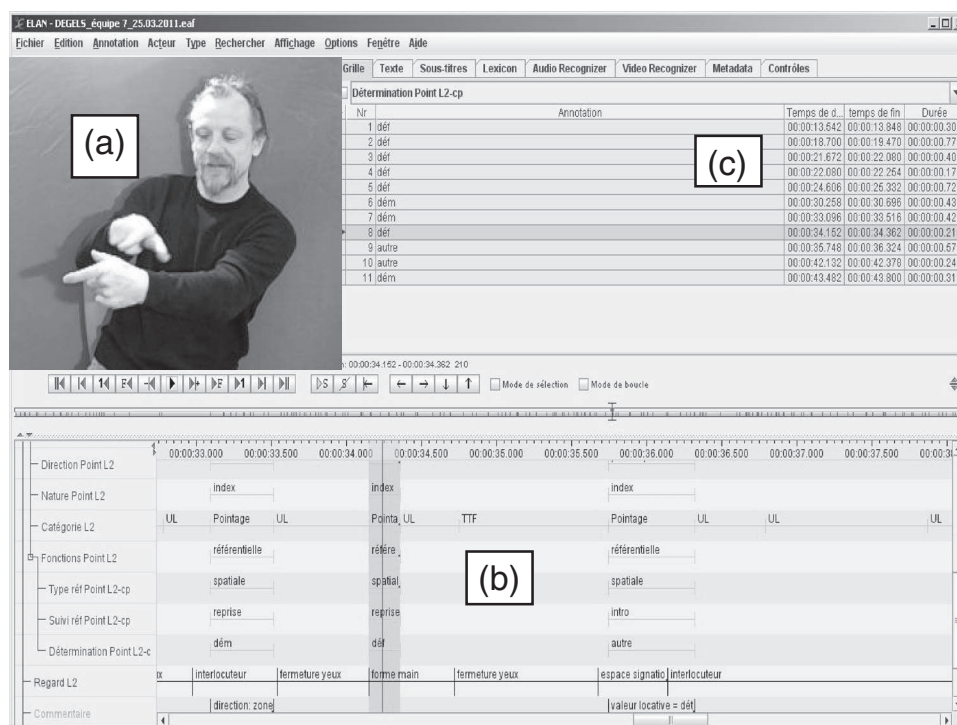
Fig. 72.4: Screen capture of annotation with ELAN (Garcia et al. 2011)

ELAN is programmed in Java under xml and is compatible with Mac OS as well as with Windows and Linux. It is part of a set of freeware tools available on the Max Planck Institute platform (Language Archiving Technology), where it is connected, in particular, to the ARBIL tool for the precise (and almost exhaustive) administration of metadata (IMDI Metadata tools). The first step in the creation of an annotation grid, is the definition of the template (e.g. tiers, types and stereotypes, controlled vocabulary), allowing a hierarchy of information determined on the basis of the desired analysis. As shown in Fig. 72.4, the ELAN grid is organized in distinct parts: (a) the video, which progresses in sync with the other elements, (b) the annotation grid, and (c) additional textual and numerical elements. The video alignment indicator (or cursor) is symbolized by a thin vertical line in the grid (b), thus keeping track of the video reference. Once the annotation template is established, annotation can be performed simultaneously by multiple annotators, thus promoting interaction between users.