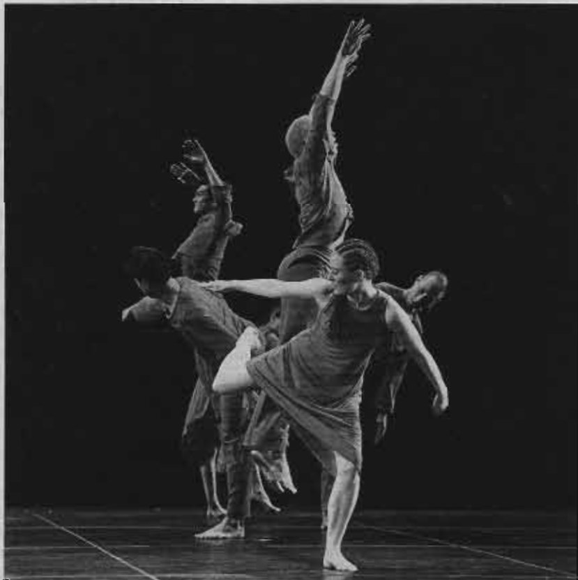
Trisha Brown Company in 'Twelve Ton Rose'