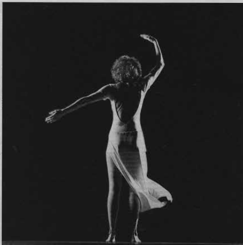
Trisha Brown in 'If you couldn't see me'

Trisha Brown not only set the tempi of her dance as it has developed over decades of work independent of music against the metrical (and particularly authoritarian) tempi of Bach; she has also inadvertently given us a history lesson in the relationship between music and dance in which until now she has been prominent only in her absence.