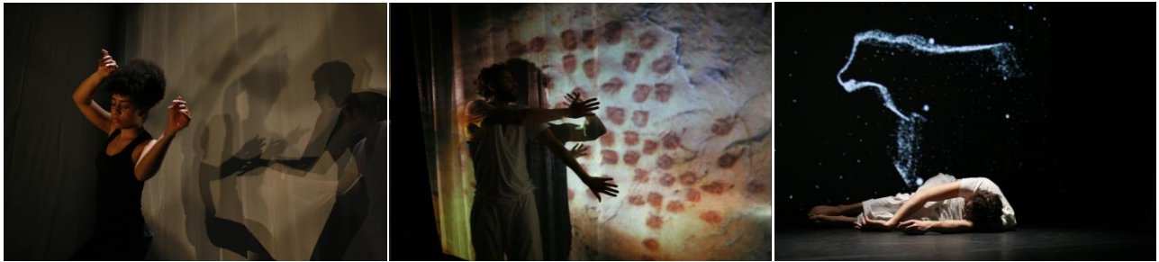
Figure 2. stage pictures of the scenarii; left: shaman spirits shadows (1); center: palm-painting (3); right: animals spirit (5).

a piece of tulle. Scripted from the first collection of scientific and historical data—as improvisation tool for acting and dancing, the director speaks a tale. The tale gives both context and indication of the performers to act and use the digital environment developed in real time.