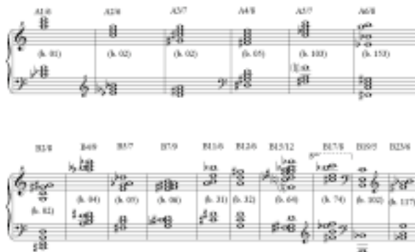
Figure 3: Some A- and B-category chords. Above the staff: our labeling (2d integer informs the chord's number of pitches); inside: bar number.

The chords heard at the first moment of the piece, are in fact a number of instances of the two main sonic categories which will constitute the core of the musical kinesic. The first category (we label A) is a 'bi-triadic' vertical structure, built upon two superposed major, minor, augmented or diminished triads. The objects of this category tend to feature a resonant, if not consonant, sound design. Some of them may have an added 7th and/or 9th, which reforce this resonant (harmonic) trend. On an opposite way, the second (B) category objects are rather based upon chromatic relations, with a large amount of seconds and fourths, which make them undoubtedly inharmonic, 'anti-resonant', almost 'noisy' (see fig. 3 some samples of both categories of chords).