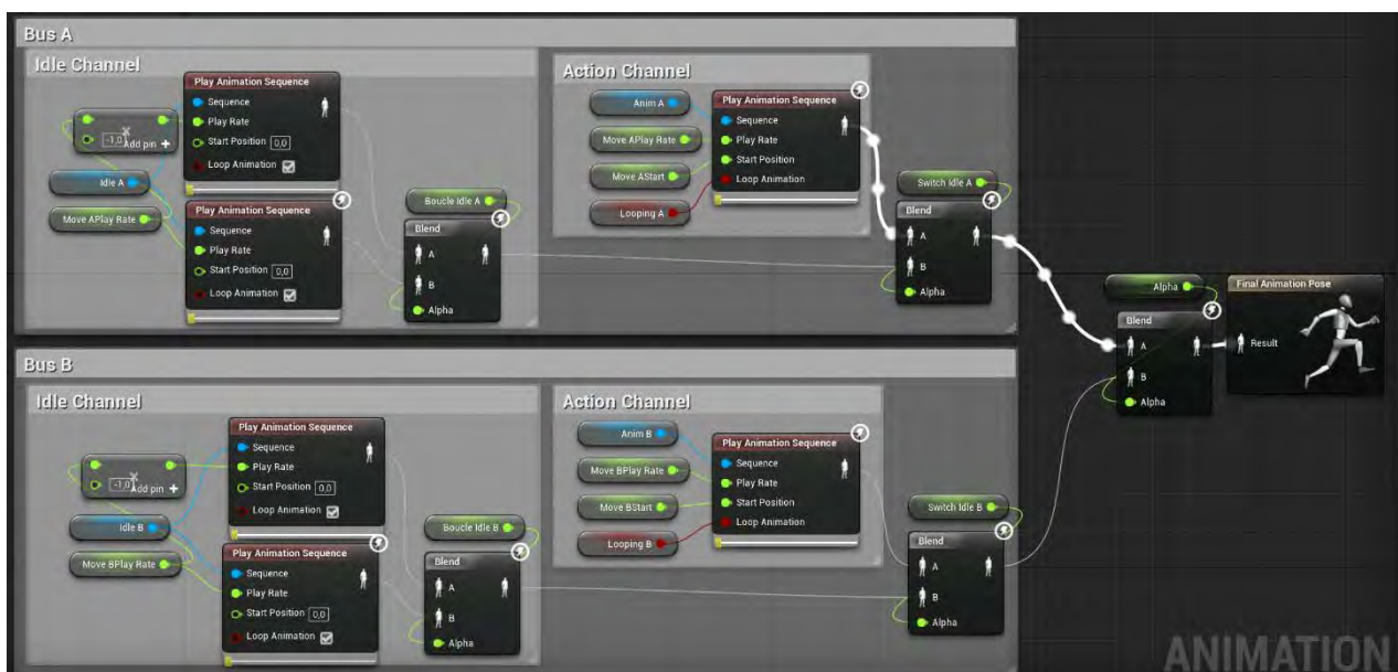
Figure 3. Unreal Engine 4 animation Finite State Machine of a specific type of OAV

Firstly, OAV can be controlled in real time by a mocaptor, acting in front of the screen, or aside the stage, hidden or not. The OAV figures out a living shadow that acts on the 3D stage in respect of a scenario in