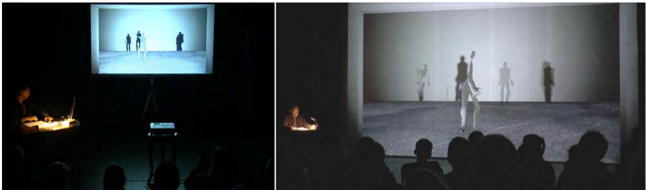
Figure 2 : Shadow Theater and Shadow Avatars

The idea of the virtual “castelet” is to simulate both the living art style of playing with shadows and puppets, and the physical structure with its light and set requirements. CAVOAV is the French acronym for the “CAstelet Virtuel d’OmbrAVatar” concept, that we adapt in English as CAstelet in Virtual reality for shadOw AVatar.