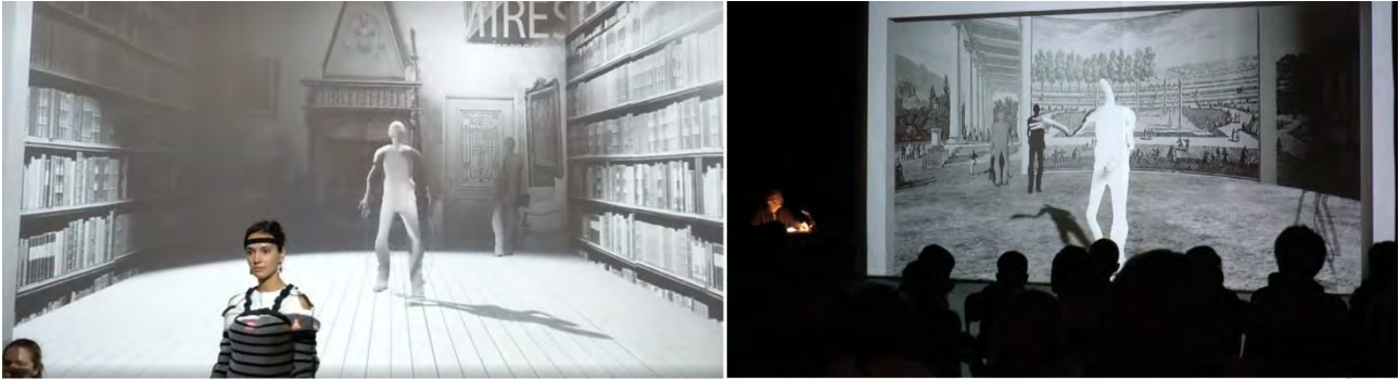
Figure 4. Masterclasses (left) and The Shadow performance (right) use cases.

Even if an immersive use of CAVOAV has not yet been practiced, the combination of avatar embodiment and play with the avatar own shadow results in an acting constraint that elicits the students to a better understanding of the expressive possibilities of the mixed reality stage virtual part. That deepens the interaction qualities between physical and digital partners. Virtual reality brings a new and unique possibility of making alive 2D shadows and enlarges the range of theatrical situations.