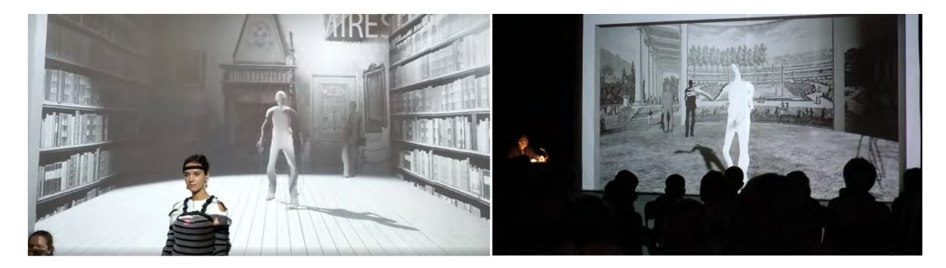
Figure 4. Masterclasses (left) and The Shadow performance (right) use cases.

Even if an immersive use of CAVOAV has not yet been practiced, the combination of avatar embodiment and play with the avatar own shadow results in an acting constraint that elicits the students to a better understanding of the expressive possibilities of the mixed reality stage virtual part. That deepens the interaction qualities between physical and digital partners. Virtual reality brings a new and unique possibility of making alive 2D shadows and enlarges the range of theatrical situations.