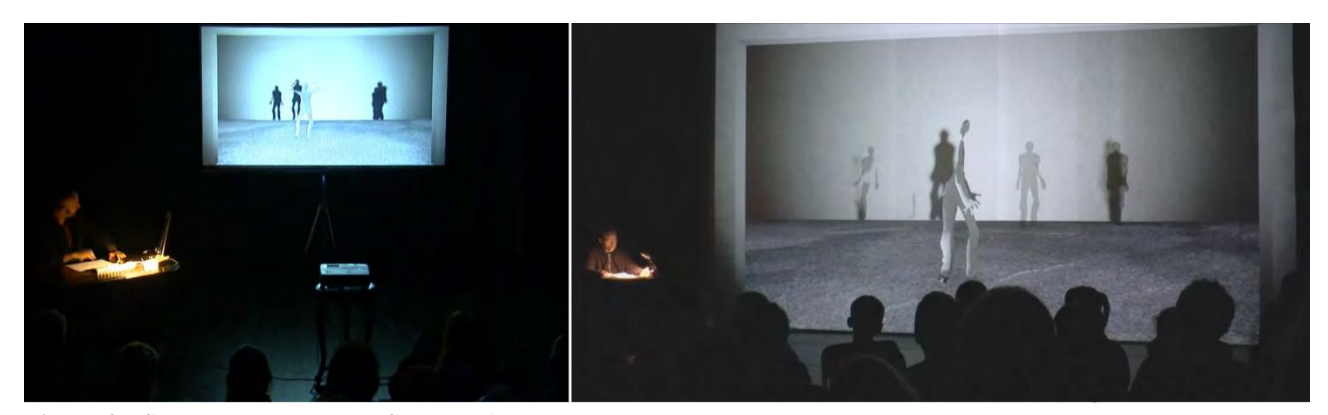
Figure 2: Shadow Theater and Shadow Avatars

The idea of the virtual "castelet" is to simulate both the living art style of playing with shadows and puppets, and the physical structure with its light and set requirements. CAVOAV is the French acronym for the "CAstelet Virtuel d'OmbrAVatar" concept, that we adapt in English as CAstelet in Virtual reality for shadOw AVatar.