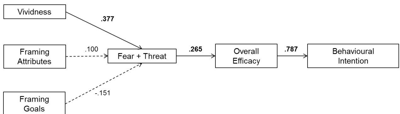
Figure 2. Results for the hypothesised model

Note: N= 120; Unstandardised values are presented; Bootstrap sample size = 5000; CI = Confidence interval.