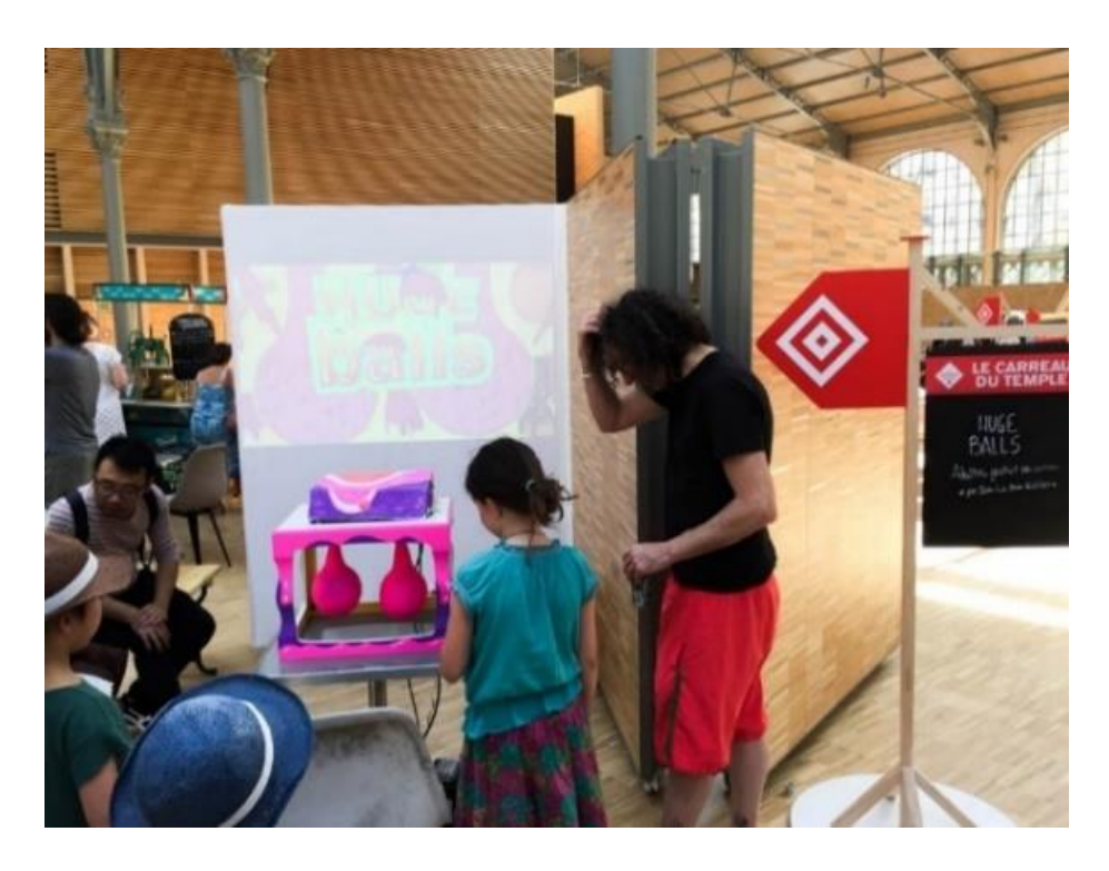
Fig 1. Huge balls in the exhibition Jonglopolis at the Carreau du Temple in Paris in 2018.