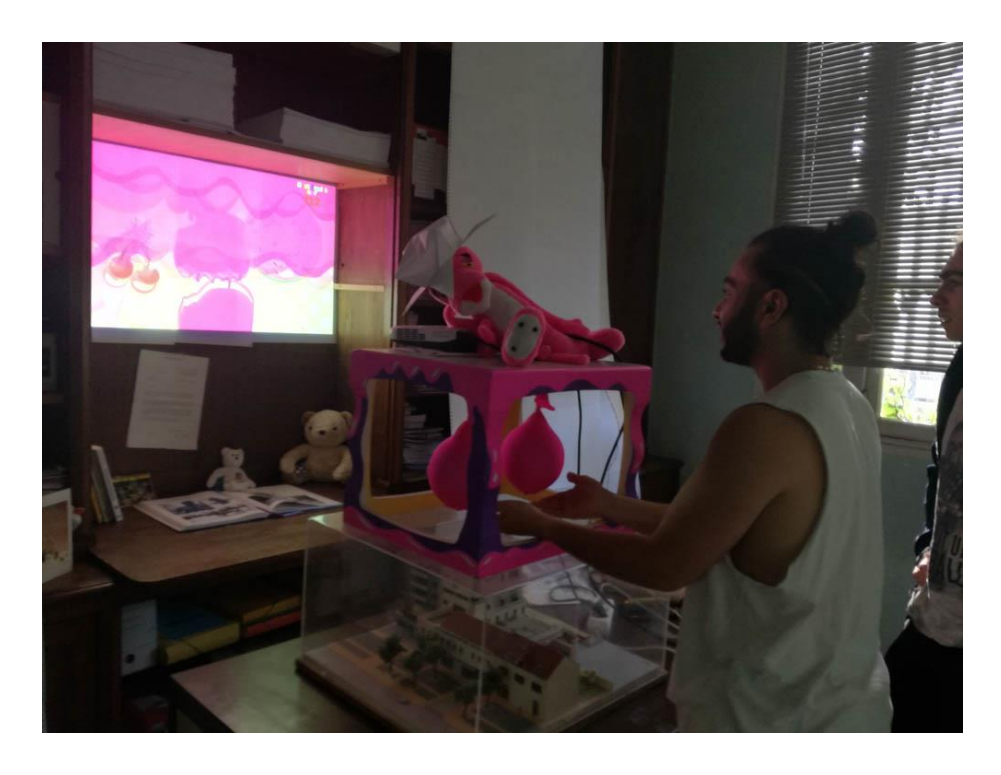
Fig 2. Huge balls version.2 in the exhibition Malakoniarof in Malakoff, 2018.