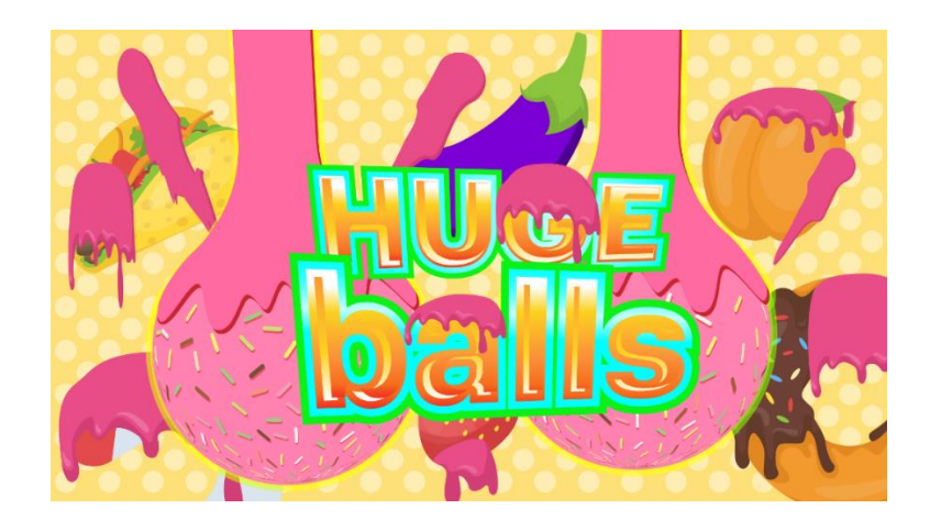
Fig 3. The visual elements inside Huge balls .

To push this idea further, we decided to explore the double sense inside the installation with its physical interface. In the eye of the adults, those two balls-like controllers constantly give them strong hints to connect those elements (both visual and tactile) with sexual representations within their own experiences, thus completely ignoring that the gameplay is about joggling. While for kids, the controllers have been positioned relatively high to block their vision, forcing them to peep through the controllers to play the already visually confusing game (see Fig 4). For them, the gameplay is about finding a balance to continue the game and to get a higher score.