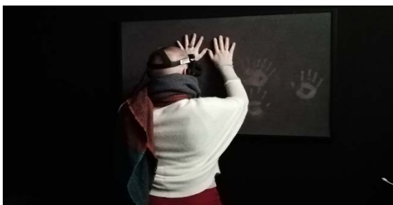
Figure 2: Interacting with VitRails in Laval Virtual 2018.

Inside the room there are two abstract figures, which narrate fragments of different stories. The voices of these figures are getting louder as the user leans on the wall. Through this setup it seems like the visitor is placed outside of the virtual world and in order to understand of what he is seeing he must eavesdrop the whispers of the figures.