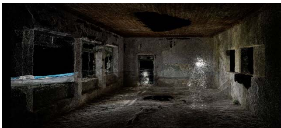
Figure 1: The VR environment in VitRails .

other universe consists of a room inside an abandoned school, surrounded by the sea, which is visible through the rear door of the room, as well as the windows on the left wall. Outside of one of the windows of the room the user can also see a small boat.