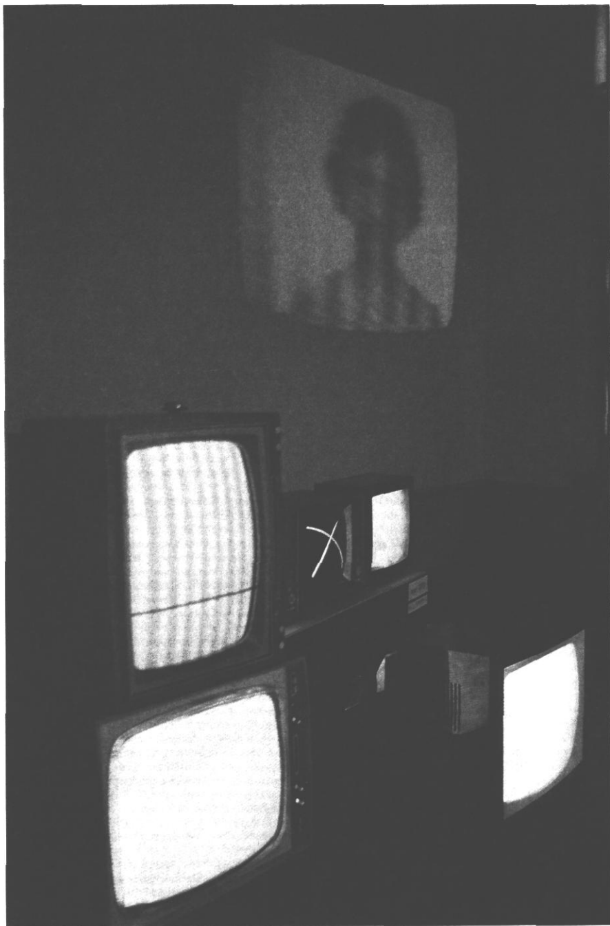
Jean Otth, Abécédaire télévisuel I , 1972

Exhibition view, Implosion , Musée cantonal des Beaux-Arts de Lausanne, Lausanne, 1972